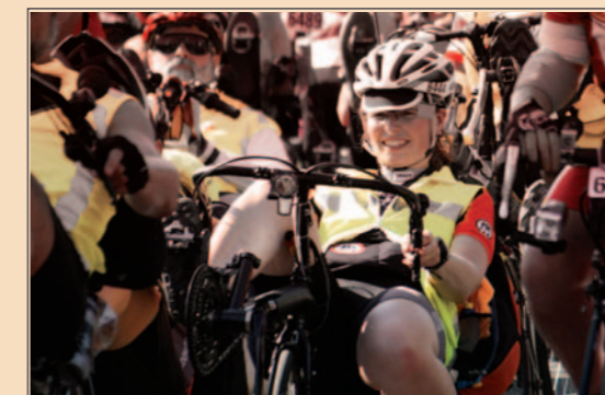
The calendar of the French and international BRMs is available on the PBP Web site: www.paris-brest-paris.org